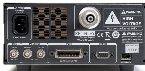
2290-10 rear panel showing the IEEE-488 interface connector, RS-232 interface connector, high voltage output connector, analog control/output connectors, and interlock connector.