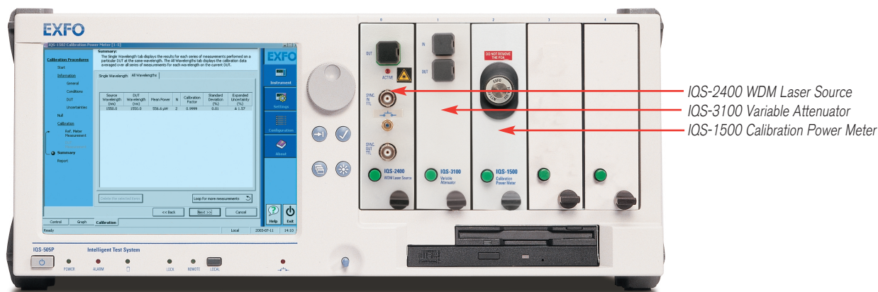
A typical power-measurement setup.

This procedure yields a detailed calibration report (in HTML format), with total calibration uncertainty for each calibrated wavelength. Data can be saved on a floppy disk, the system's hard drive or a remote controller station, making storage space practically limitless. Thanks to Windows-based software, the IQS-1500 can work with any compatible system.