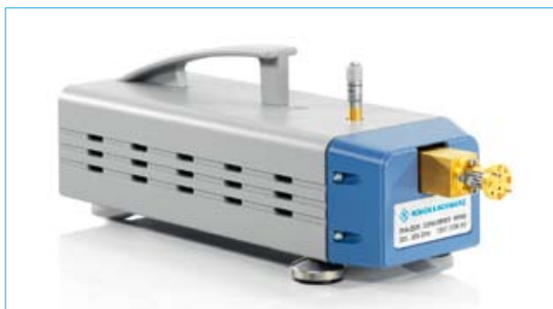
R&S®ZVA-Z325 – 220 GHz to 325 GHz (J band)