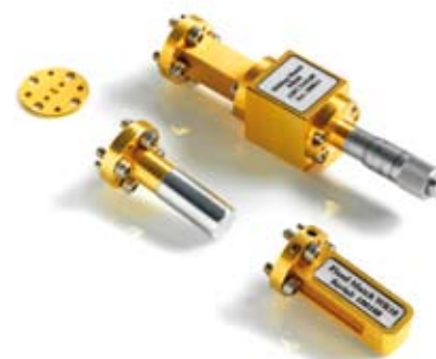
R&S®ZV-WR10 calibration kit with sliding match