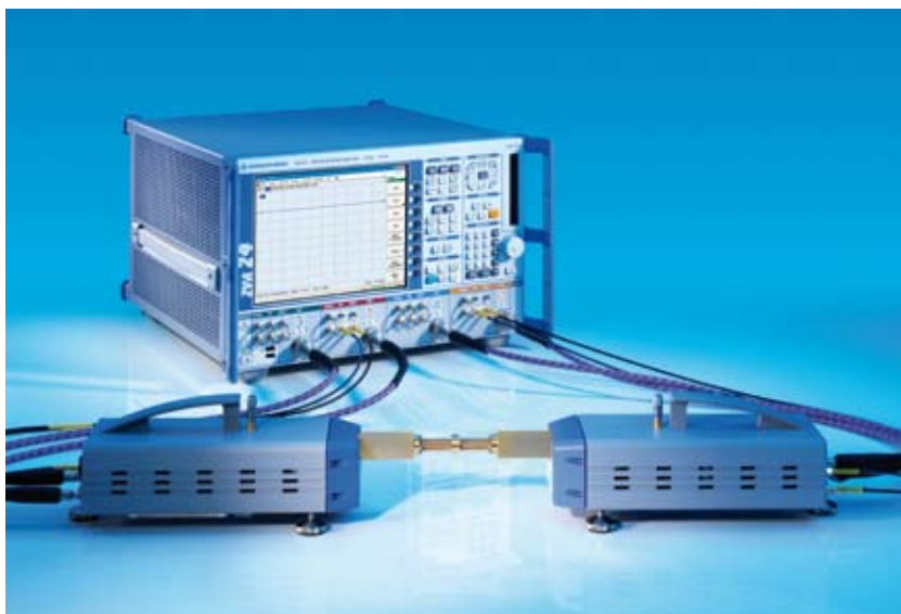
Setup for a two-port measurement showing a through connection. A four-port network analyzer eliminates the need for controlling an external generator that supplies the LO signals.

The Rohde & Schwarz converters enable network analysis in the frequency range from 50 GHz to 75 GHz (R&S®ZVA-Z75), 75 GHz to 110 GHz (R&S®ZVA-Z110) and 220 GHz to 325 GHz (R&S®ZVA-Z325) using an R&S®ZVA24, R&S®ZVA40, R&S®ZVA50 or R&S®ZVT20 network analyzer. Featuring a high dynamic range, the converters set new standards. Moreover, they are easy to install, offer high operating convenience and allow fast measurements. For a two-port measurement, you only need a four-port network analyzer and two converters; no external generator is required. When using a two-port network analyzer, you need an external generator to supply the LO signals.