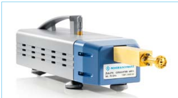
R&S® ZVA-Z75 – 50 GHz to 75 GHz (V band)