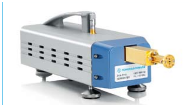
R&S® ZVA-Z110 – 75 GHz to 110 GHz (W band)