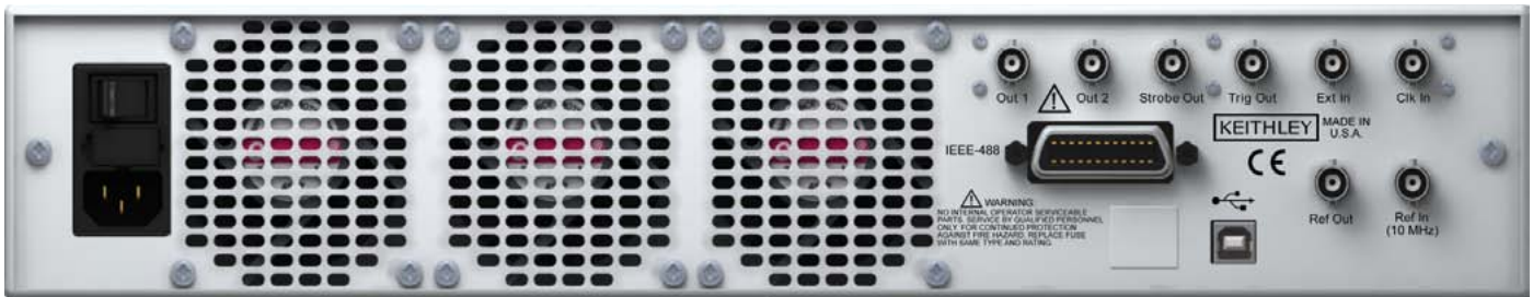
Figure 2. Model 3402-R, Dual-Channel with Rear Outputs

CONTINUOUS: Trigger circuitry is always armed. TRIGGERED: Trigger arming is edge sensitive, needs selected edge prior to allowing trigger event. GATED: Trigger arming circuitry is level sensitive, always armed when selected level is present.