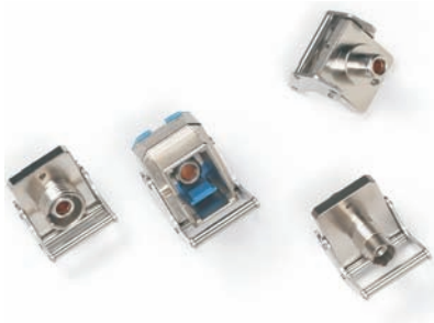
Optical adapters (BN 2150)