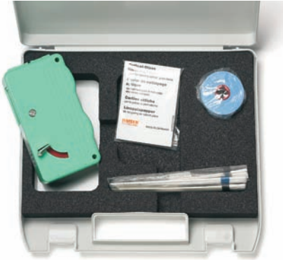
OCK-10 Optical Connector Cleaning Kit (accessory)