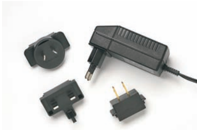
Worldwide compatible AC adapter/charger (SNT-121A)

on the fiber, 1490 and 1550 nm downstream and 1310 nm upstream. The 1310 nm channel provides correct power measurements of burst type upstream PON signals.