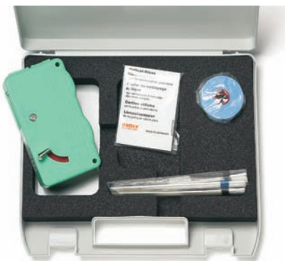
OCK-10 Optical Connector Cleaning Kit (accessory)