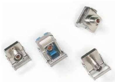
Optical adapters (BN 2150) for laser source output