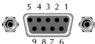
RS-232 pins description

If your computer is using a RS232 interface with a DB-25 connector, you need a cable and a adaptor with a DB-25 connector at one end and DB-9 connector at the other end (not a null modem).