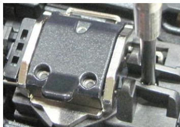
How to set

Note: CLAMP-S70 series is supplied as a pair, for the left and the right respectively.