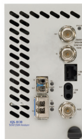
■ IQS-8130 SONET/SDH/OTN