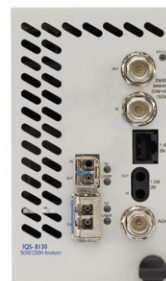
■ IQS-8130 SONET/SDH/OTN