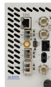
■ IQS-8130NG with next-generation SONET/SDH/OTN hardware including optical and electrical Ethernet add/drop interfaces