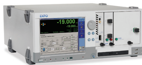
■ EXFO's IQS-8120/8130 Transport Blazer Test Modules are housed in the IQS-600 Integrated Qualification System, EXFO's powerful lab/manufacturing test platform.

Combined with the built-in IQS Manager software, the IQS-600 platform provides an easy-to-use environment to manage your modules, configure your system, launch applications and analyze results. What's more, it can be controlled using local applications or through GPIB, RS-232 or Ethernet interfaces.