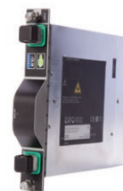
This picture is shown as a guideline only. Actual module may differ depending on the configuration selected.