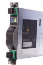
This picture is shown as a guideline only. Actual module may differ depending on the configuration selected.