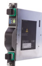
This picture is shown as a guideline only. Actual module may differ depending on the configuration selected.