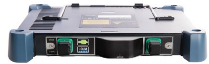
This picture is shown as a guideline only. Actual module may differ depending on the configuration selected.