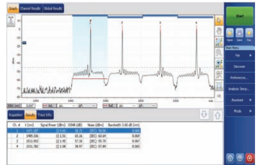
The FTB-5235 displays channel power, channel wavelength and OSNR. Above: example of CWDM network OSA display. Below: example of DWDM network OSA display.

Cable operators are not just rolling out CWDM and DWDM, they are deploying hybrid networks, where DWDM wavelengths are overlaid onto CWDM wavelengths, as well as Remote PHY. EXFO's new and compact FTB-5235 addresses all these applications with a single product, for maximum convenience.