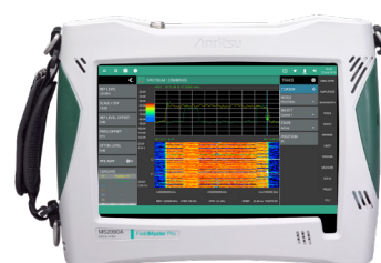
Field Master Pro MS2090A