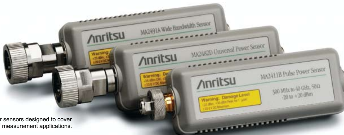
Family of power sensors designed to cover a wide range of measurement applications.

Anritsu's coaxial power sensors have been designed with just one thing in mind: everything. The range of sensors provide frequency coverage to 50 GHz, with dynamic range up to 90 dB.