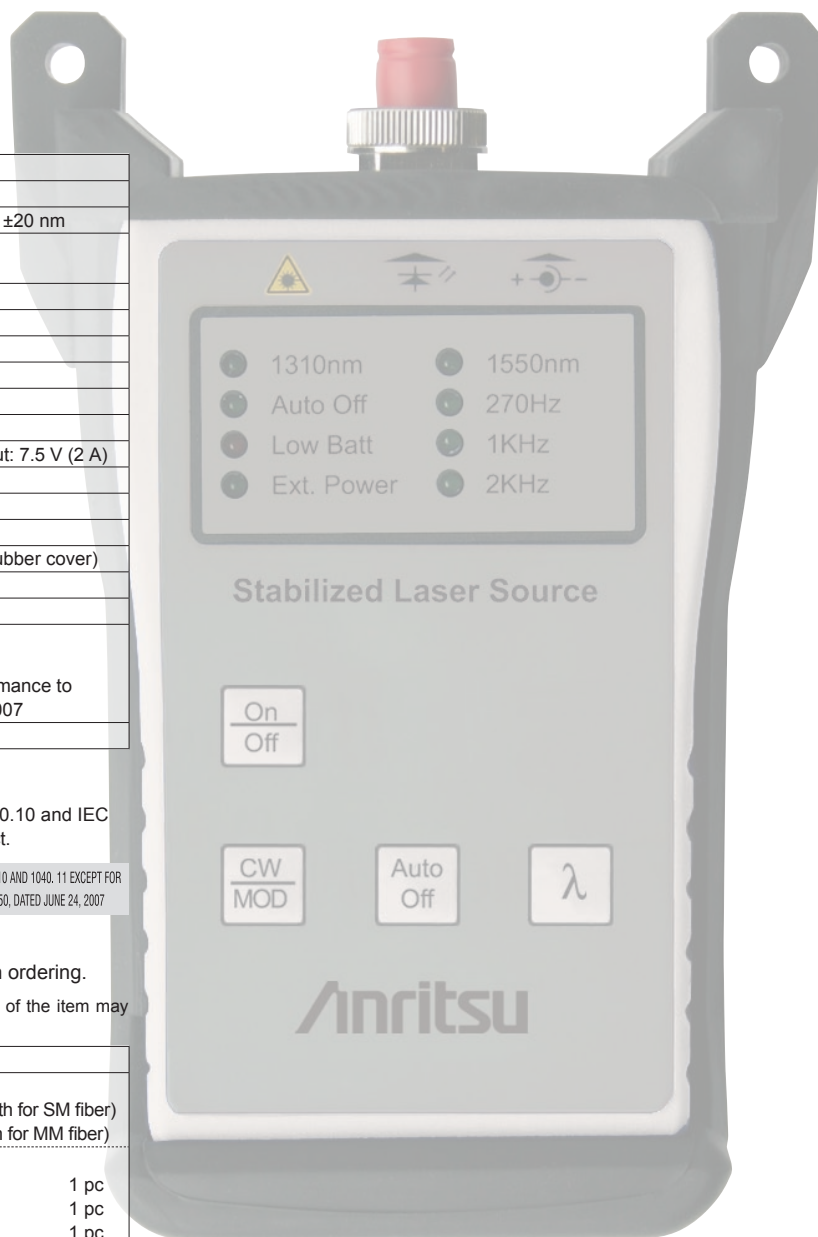
*: Photographs about same size as actual instruments.

FU=FC/PC, SU=SC/PC, TU=ST/PC, FA=FC/APC, SA=SC/APC (FA=FC/APC and SA=SC/APC cannot be selected for 5L83-YY.)