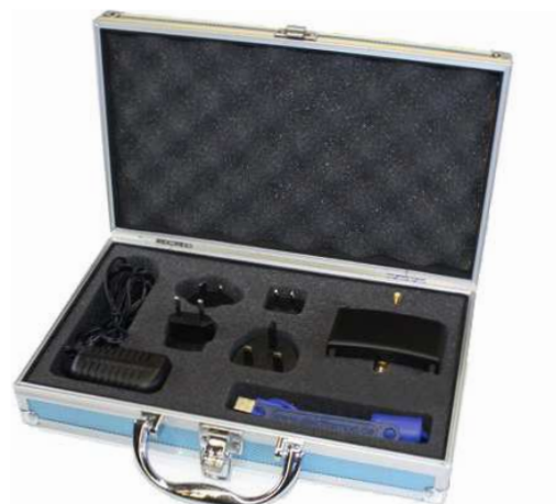
Scope of delivery: transport case, international 12V power supply, USB Cable, SMA/SMA (f/f) Adapter, SMA Tool, PC Software, Calibration data

With the very compact dimensions of just 80x50x30 mm and weighing only 150 grams, the BPSG series is predestined for mobile use and fits in every pocket. The compact form factor makes the BPSG the world's smallest battery-powered RF generator up to 6GHz.