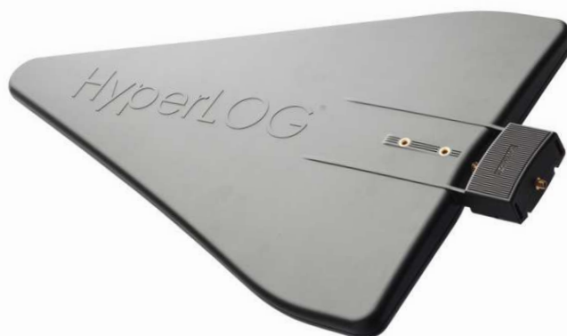
The BPSG as Field-Strength-Generator up to 3V/m (1m distance), available as „DFG 4060“

The BPSG can also be connected to an external reference clock and thus be synchronized with a measuring system. In addition, this way even higher accuracy can be achieved (Using an OCXO, Rubidium timebase etc.).